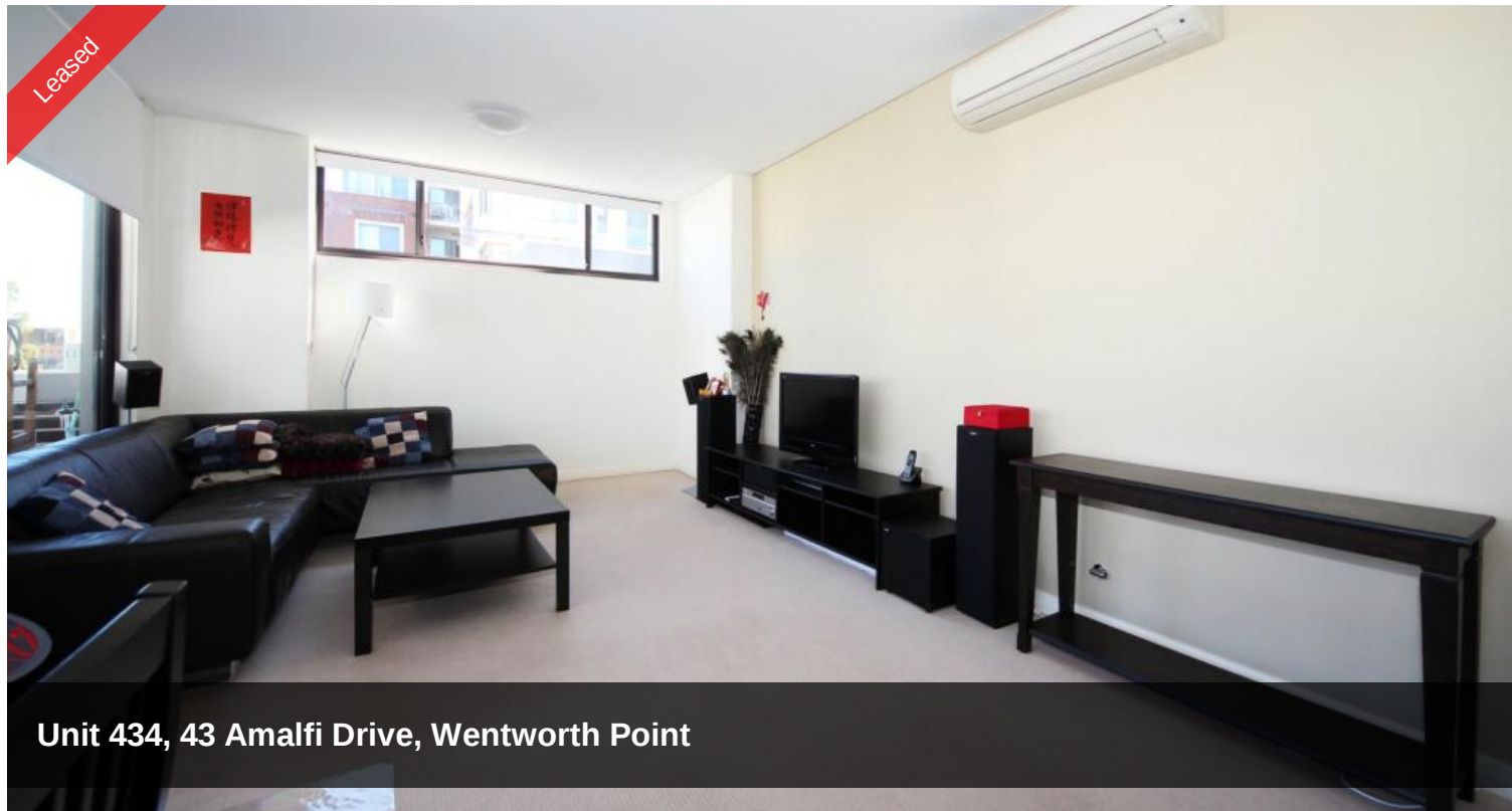
Unit 434, 43 Amalfi Drive, Wentworth Point