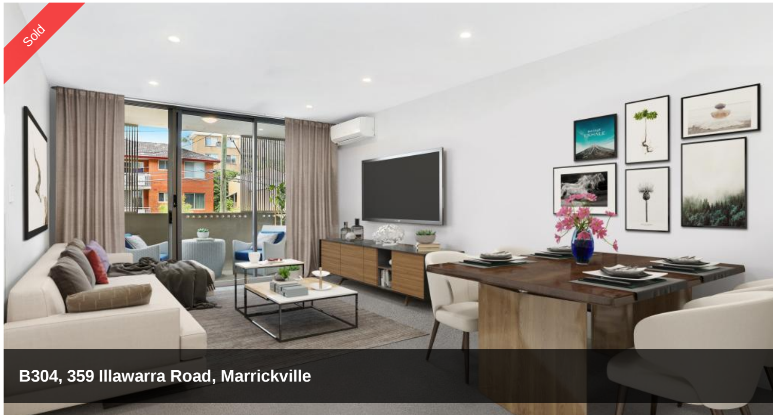
B304, 359 Illawarra Road, Marrickville