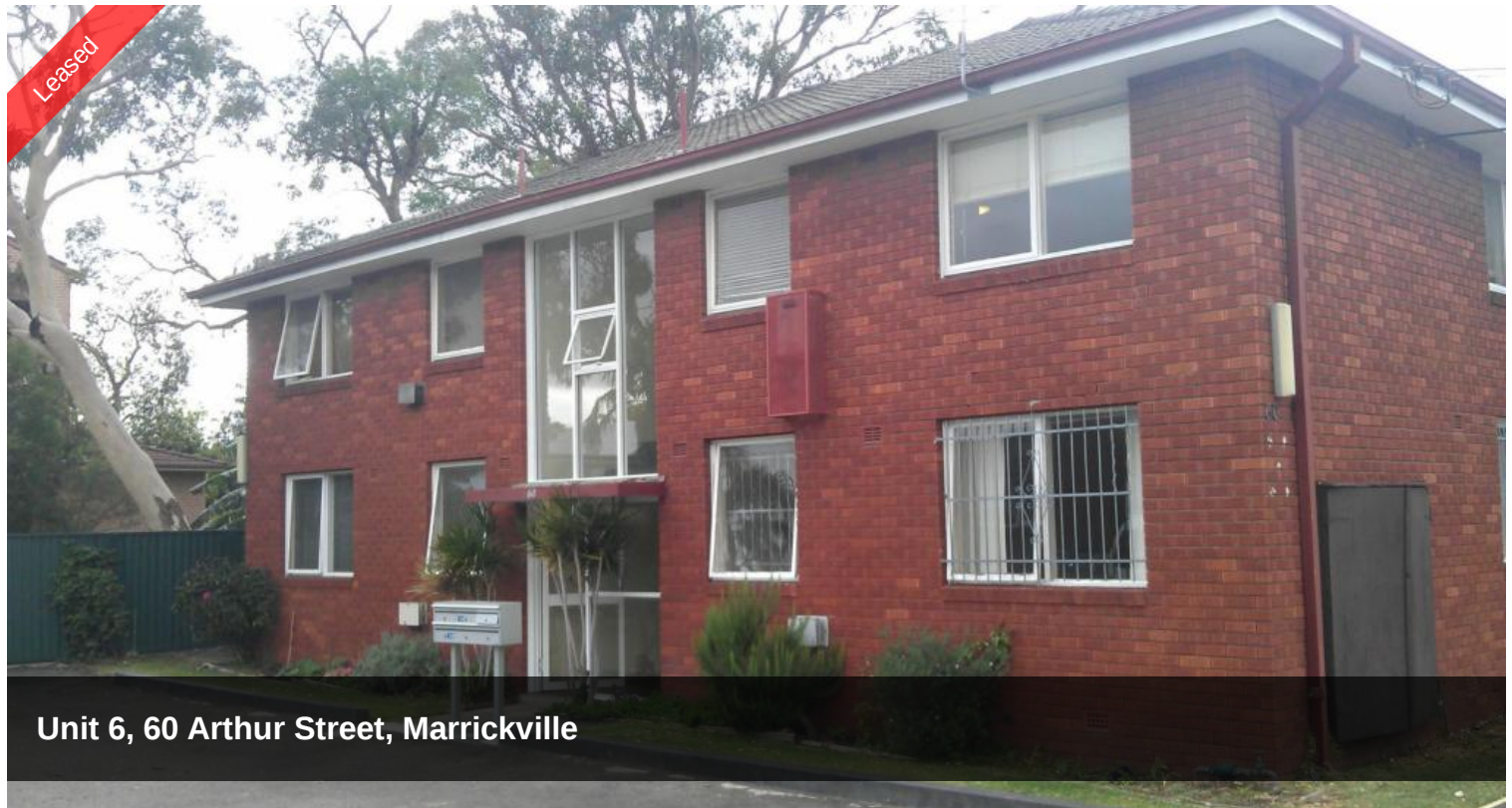
Unit 6, 60 Arthur Street, Marrickville