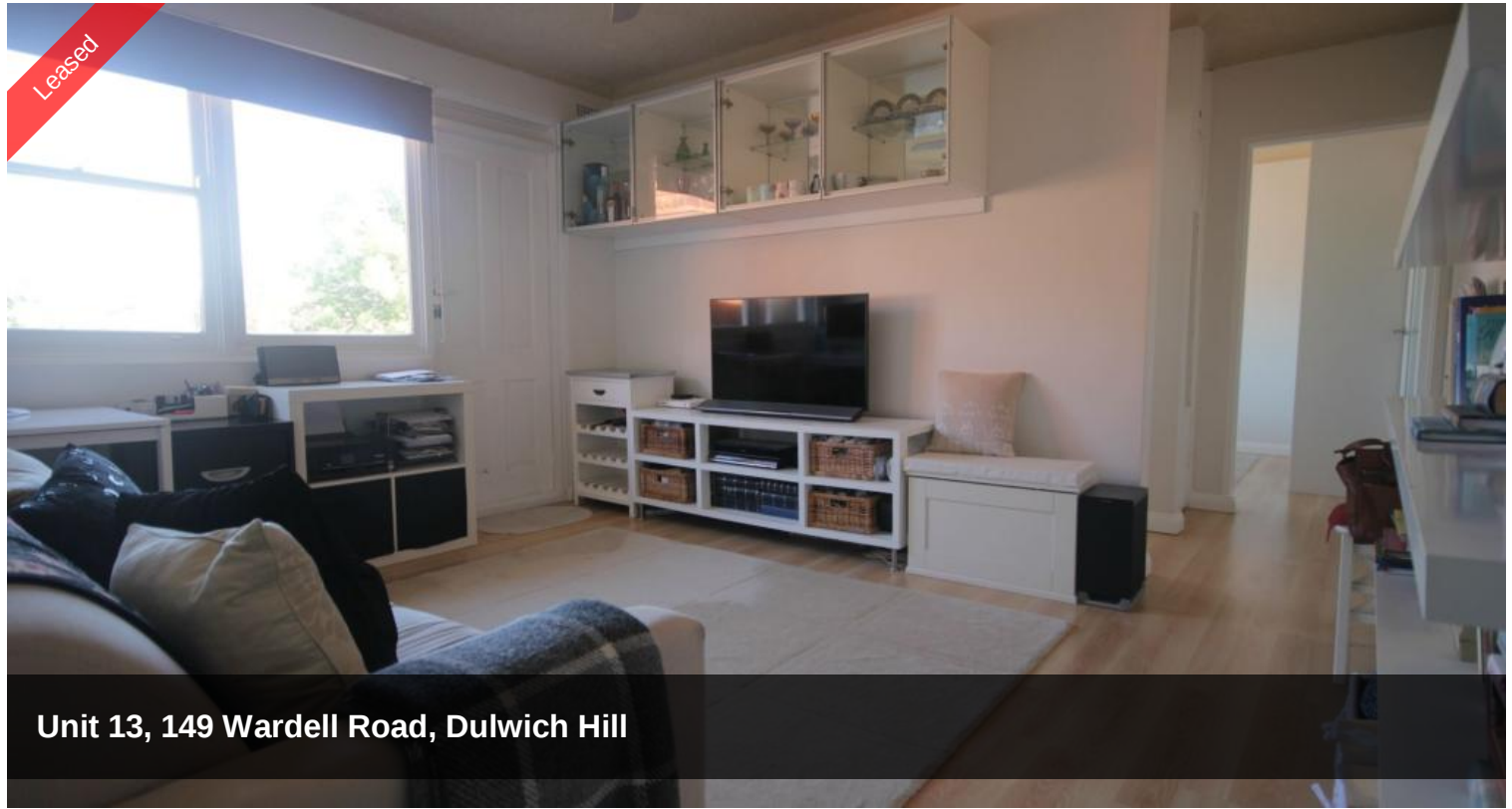
Unit 13, 149 Wardell Road, Dulwich Hill